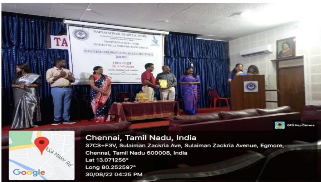
HONORING THE CHIEF GUEST BY THE PRINCIPAL