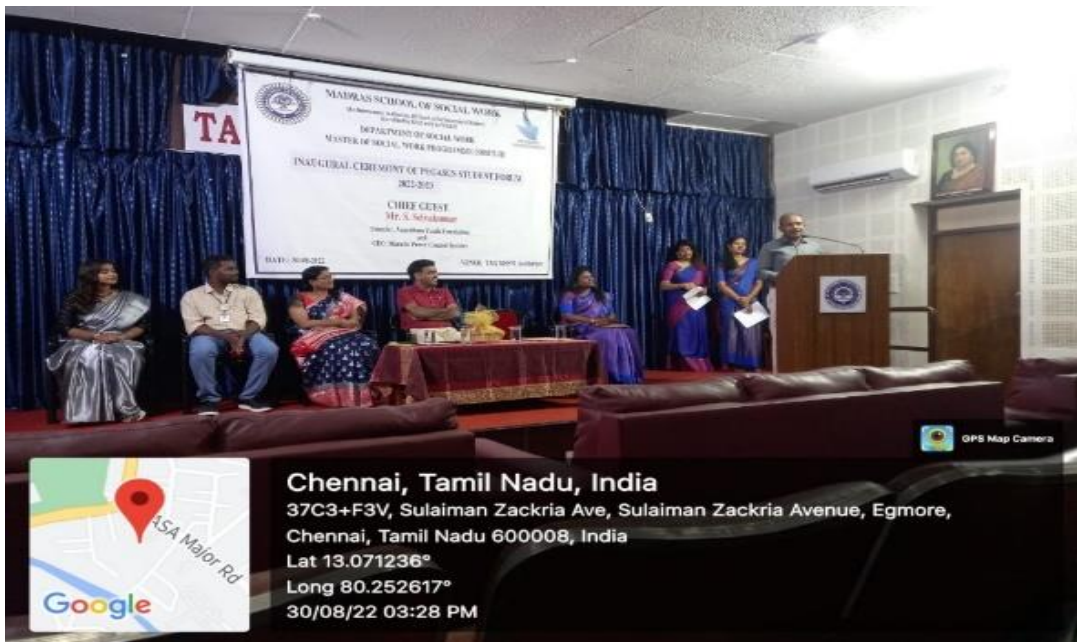
PRINCIPAL IS ADDRESSING THE STUDENTS