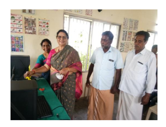
Project Committee members