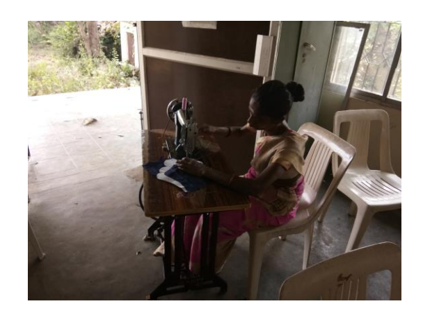
Instructor teaching Designer Blouse