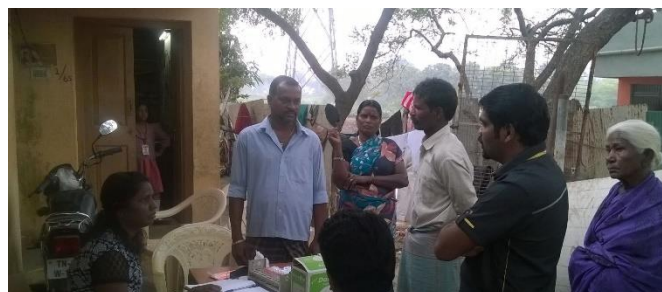
PHASE IV – SOCIAL WORK RESPONSE (3 MONTHS)

The College organized a meeting of Heads of Social Work Departments, NGOs and prominent professionals involved in relief work. The group had made progress in producing a strategy paper which will be useful to Government, Social Workers and Civil Society.