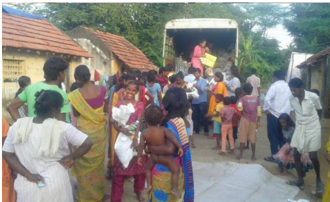
PHASE III – AFTER FLOODS (4 WEEKS)