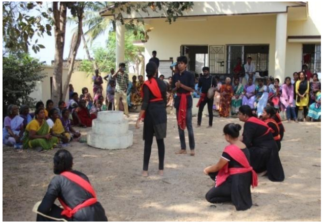
Street Play on 'Plastics'