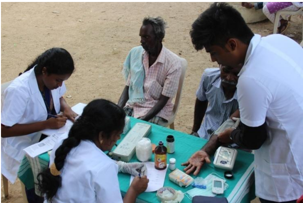
Villagers getting tested at the Medical Camp