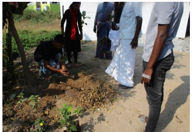
Volunteers planting saplings