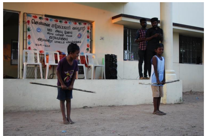
Children of the village exhibiting their talents