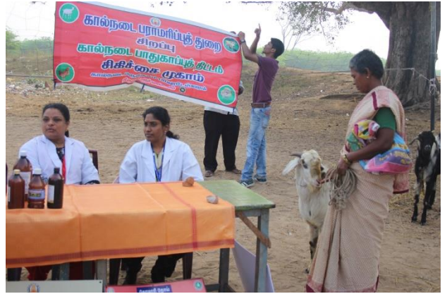
Doctors at Veterinary Camp