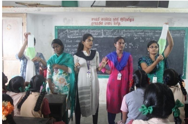
Demonstration on the use of Sanitary Napkins