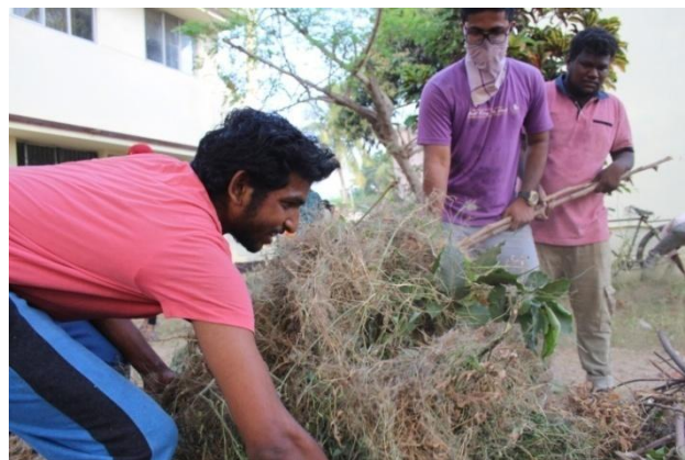
VOLUNTEERS INVOLVED IN CLEAN UP ACTIVITY