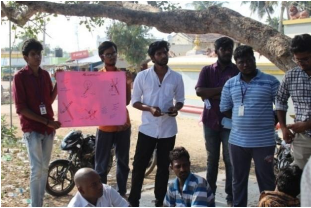
Volunteers explaining the implications of addiction