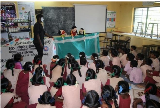
Puppetry on 'Good Touch, Bad Touch'