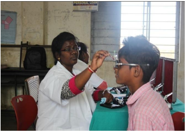
A school student at the Eye Camp