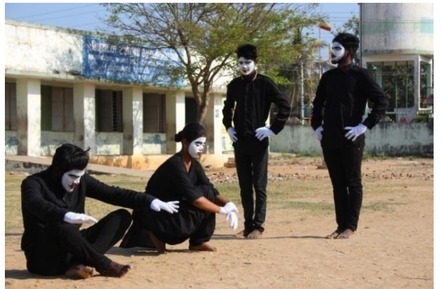
Mime on 'Personal Hygiene'