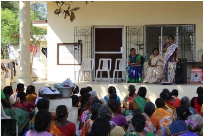
Workshop on 'Finance Management'