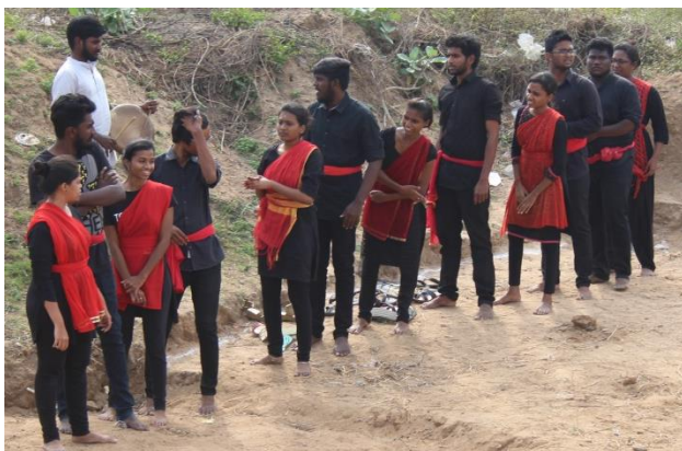
Street Play on ‘Child Marriage’