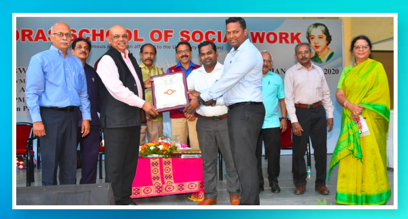
MCJ AWARD 2020 TO INTERNATIONAL JUSTICE MISSION